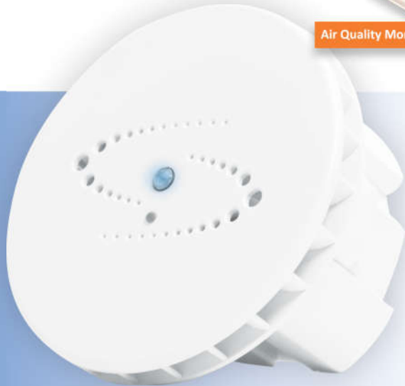
HALO Smart Sensor is Patented.